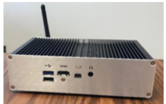
Video Control Unit