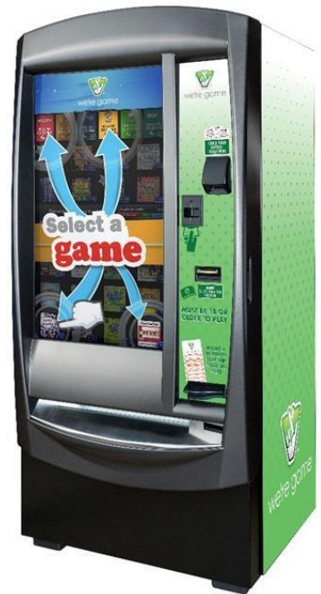
Self Service Vending Machine