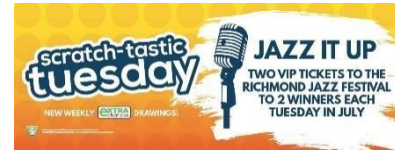
Writing Surface Insert