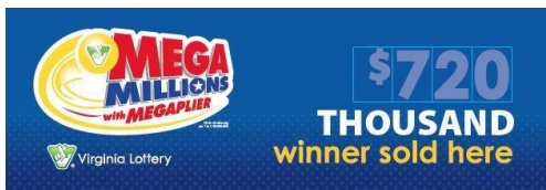
Mega Millions Winner Awareness