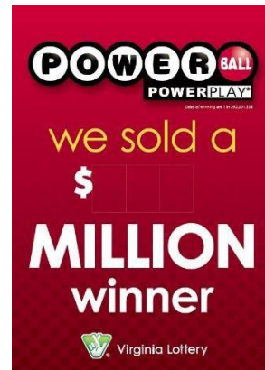
Powerball Winner Awareness