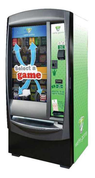
Self Service Vending Machine (28)