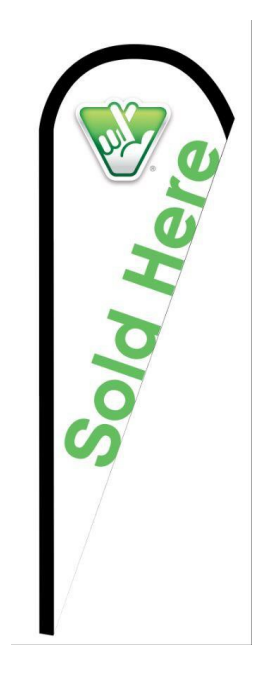
Flutter Flag Promotional Events