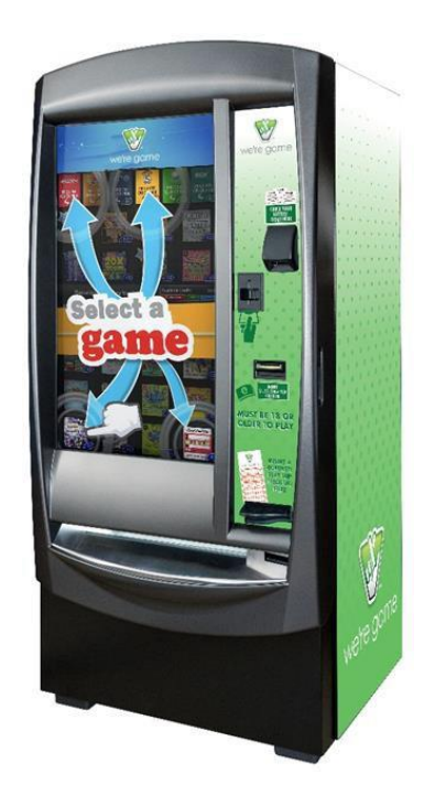
Self Service Vending Machine