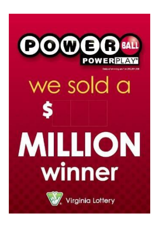
Powerball Winner Awareness