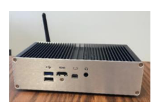
Video Control Unit